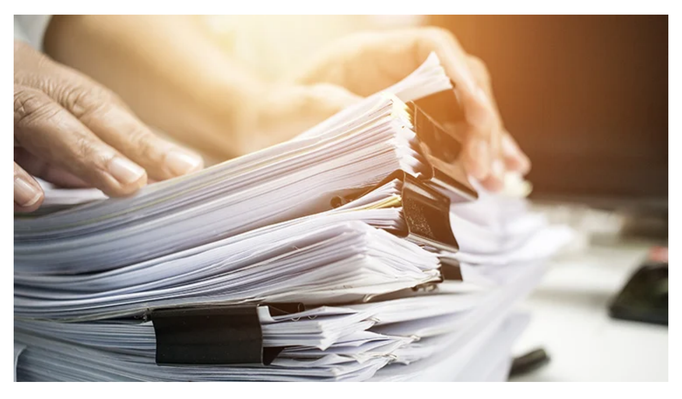
It's all in the detail!